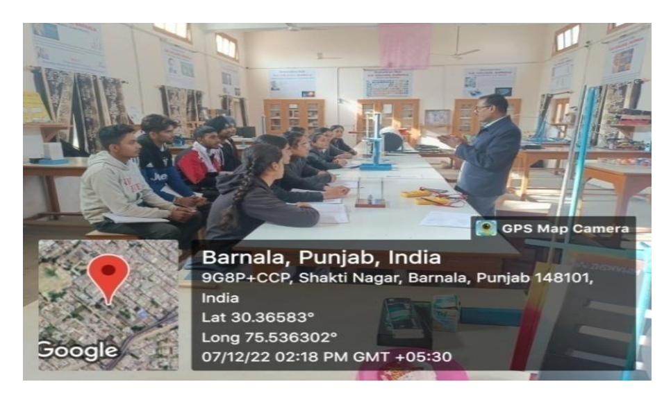
One Week hands on training for school students in Physics (5-12 December, 2023)