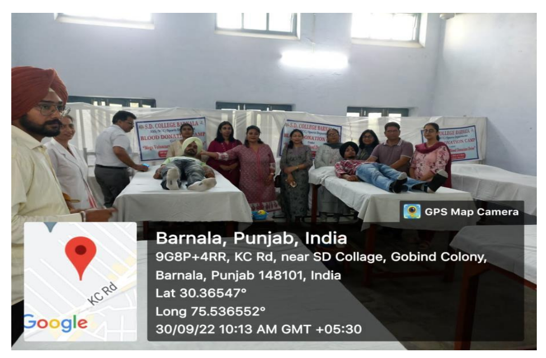
Blood Donation camp on 30 Sept. 2022