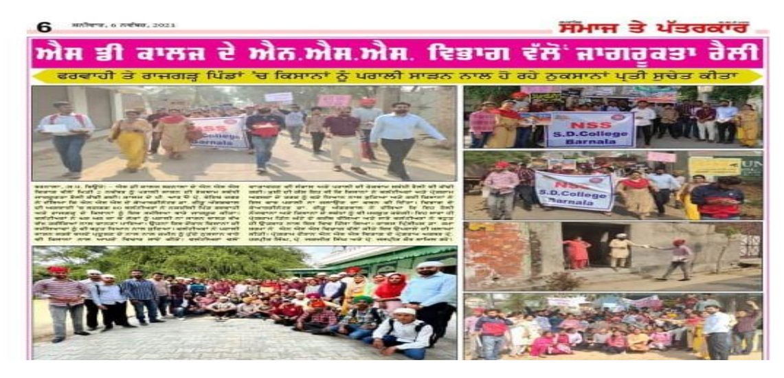
News cutting of rally regarding "Stubble Burning Awareness" on 2<sup>nd</sup> November 2021