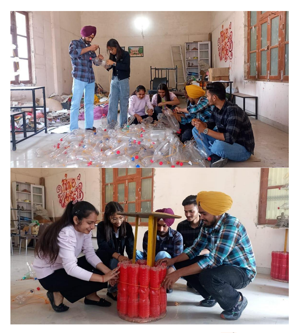
Awareness Campaign regarding Reuse of Plastic on 10th February 2023

NSS Volunteers from S.D. College initiated a project on 10<sup>th</sup> February 2023 of re-using plastic bottles collected from various garbage sources. They made hanging vertical garden with used plastic bottles. The purpose of the event was to make students aware about the conservation of their surrounding by using used plastic for various purposes. There were almost 40 volunteers who participated in the drive.