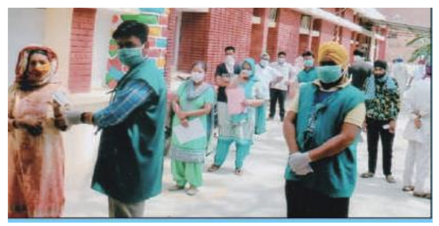
Social Services during Covid-19 Pandemic (April and May, 2020)

welfare of migrant labourers, they contributed in the community kitchen & provided them things of basic necessities. About 8 students volunteered for the services.