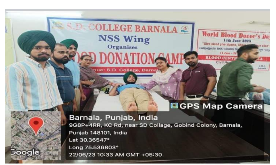
Blood Donation Camp on 22<sup>nd</sup>June

NSS wing in collaboration with NCC Wing of the college organized Blood Donation Camp on 22<sup>nd</sup>June, 2023 under the drive " Organization of World Blood Donor Day 2023 ". Faculty members, NSS and NCC volunteers donated 31 units of blood. The medical team, Civil hospital Barnala assisted in organizing this camp. The purpose of the camp was to instill the feeling of empathy for their fellow human beings among volunteers. Volunteers were sensitized about their responsibility for the community and society. The camp was successful in breaking away certain myths regarding blood donation. About 150 students took part in the event.