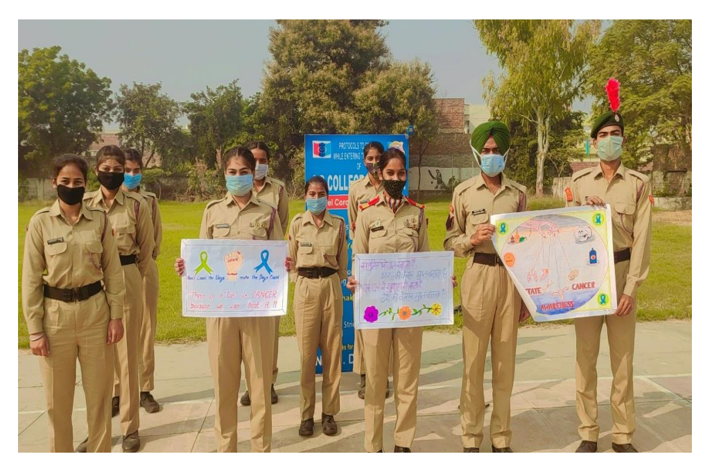
Cancer Awareness Rally and Competitions held on 7 Dec., 2020.

NCC Unit of S.D. College Barnala celebrated "Cancer Awareness Day" on 7 Dec., 2020. On this day poster making competition has been organized. During this activity cadets and college students made posters and pasted them in the city to aware locals about this dreaded disease. About 23 students participated in the event.