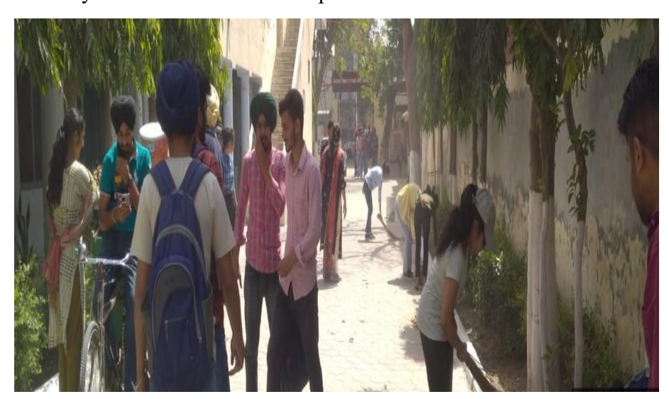
Cleanliness drive in month of October, 2021

During the month of October 2021, NCC cadets carried out the cleanliness drive in the College campus and vicinity. About 78 students took part in the event.