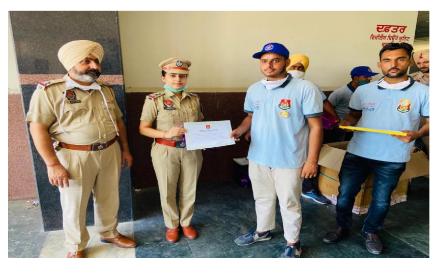
Awareness Campaign regarding Covid-19 Apps during Lockdown (Year 2020)

During the beginning of Pandemic Covid 19, NSS volunteer SD college Barnala in collaboration with District Administration Barnala assisted the people to download the Arogya Setu App and Covid 19 Apps. They took out this awareness drive from door to door also. Some volunteers also assisted Punjab police during lockdown. About 39 students volunteered for the awareness campaign.