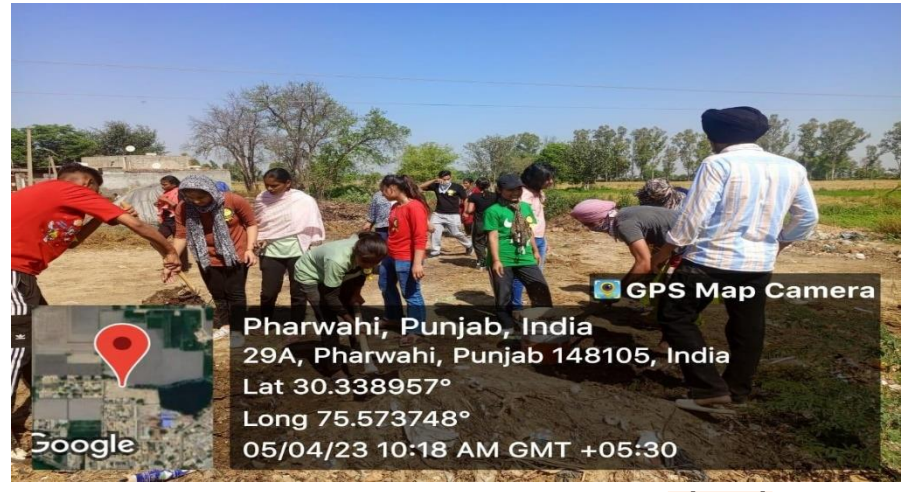
Seven Day and Night Camp at Village Pharwahi (4th -10th April 2023)