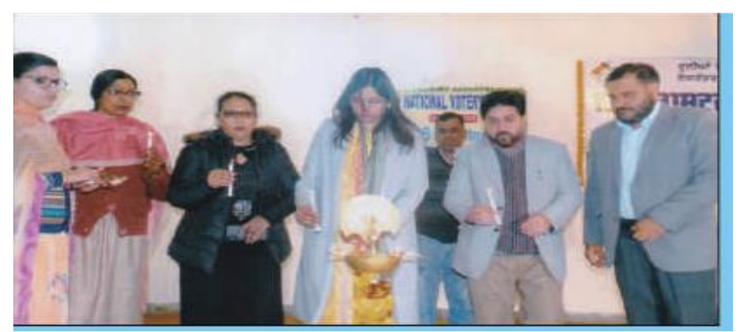
Seminar on National Voter Day (25th Jan., 2020)

On the occasion of National Voter Day (25 January, 2020), SD College Barnala, organised seminar in which Deputy Commissioner Shri Teg Partap Phoolka honoured PWD employees for their services in issuing voter card. Besides this, chief guest also honoured people who offered their services during Lokh Sabh election 2019. Students presented skit on this occasion. Student were motivated to cast their vote and strengthen the democracy. About 130 individuals participated in the event.