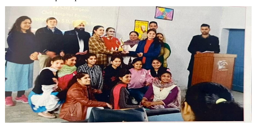
Awareness Program against "Tobacco Use" held on June 6, 2021

Awareness Program against Tobacco Use was organised on June 6, 2021. Students took a pledge for not taking Tobacco and other drugs which are injurious to health. Students were appealed to make aware the other people of society also such as neighbours, community workers and their friends. Poster-making and slogan writing competitions were held on this topic. About 130 students participated in the event.