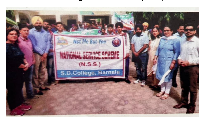
Environment awareness rally against stubble held on 4th October 2019

NSS unit organised an environment awareness rally against stubble burning in adjoining villages Pharwahi, Dangarh, Kattu and Uppli on 4<sup>th</sup> October 2019. Volunteer interacted with local farmers and made aware them about the ill effects of smoke produced during stubble burning. More than 60 individuals including staff and students participated in the event.