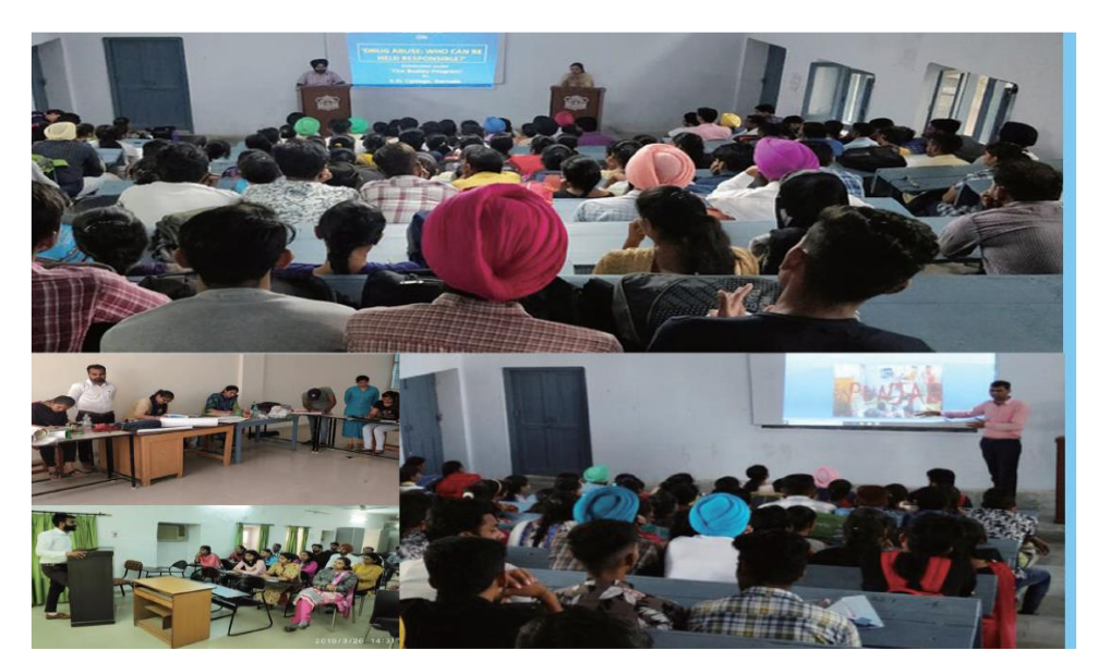
Glimpses of awareness event "Buddy Program" held on 23 March, 2019.

With the mission to fight against Drug Abuse in state, The Govt of Punjab have been running first of its kind initiative called Buddy Program. Under this Program, the college organised many activities like lecture, debate competition, poster competition and PPT presentation on 23 March, 2019. The Buddy program aims to educate student about the ill effects of drug abuse and generates positive peer influence. Student developed knowledge, right attitude and behaviour along with skills to prevent drug abuse. This program is key to Punjab fight against drugs as it covers the adolescent age groups and young adults. More than 800 students participated in the event.