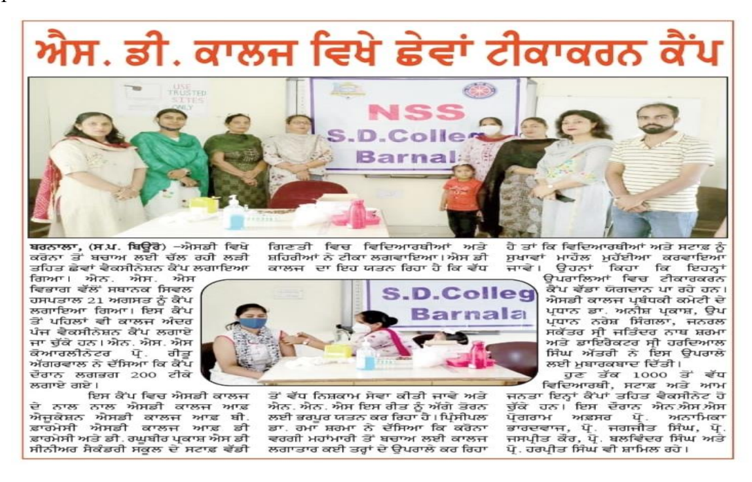
News cutting of "COVID Vaccination Drive Camp-VI" on 21st August, 2021

On 21<sup>st</sup> August 2021 NSS department collaboration with Civil hospital Barnala held its 6<sup>th</sup> consecutive corona vaccination camp in the college campus. 200 people including staff members from other institutes of S.D. Educational Institutions, citizens and students took advantage of this camp and got vaccinated. 200 people including students get vaccinated in the camp.