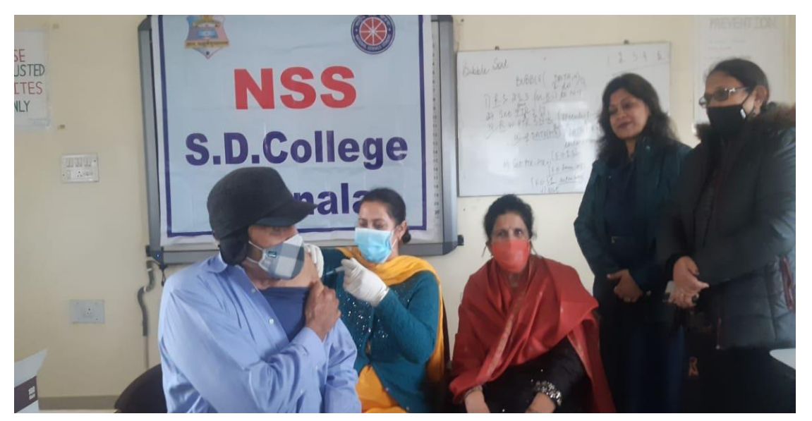
Glimpses of "COVID Vaccination Drive Camp-VII" on 14 Jan, 2022

On 14<sup>th</sup> January, 2022, NSS department collaboration with Civil hospital Barnala organized its eighth corona vaccination camp in association with civil hospital Barnala. Around 150 students and citizens got vaccinated in the camp.