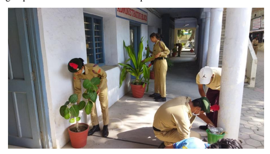
Conservation Drive to Save the Plants and Trees in the month of September, 2021

To save plant and trees of the campus and surroundings, NCC unit of the college carried out in the month of September, 2021. During this event, NCC cadets carried out tilling, deweeding and manuring of plants. About 45 students took part in the event.