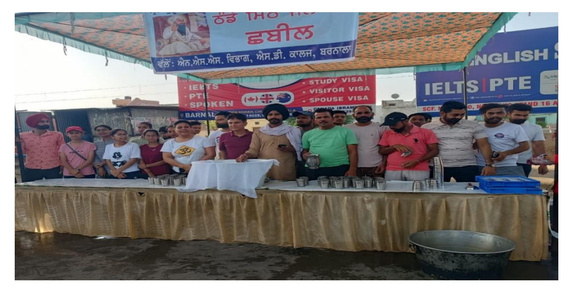
Glimpses of Sweet Water offerings (Chabeel) on 3rd June 2022