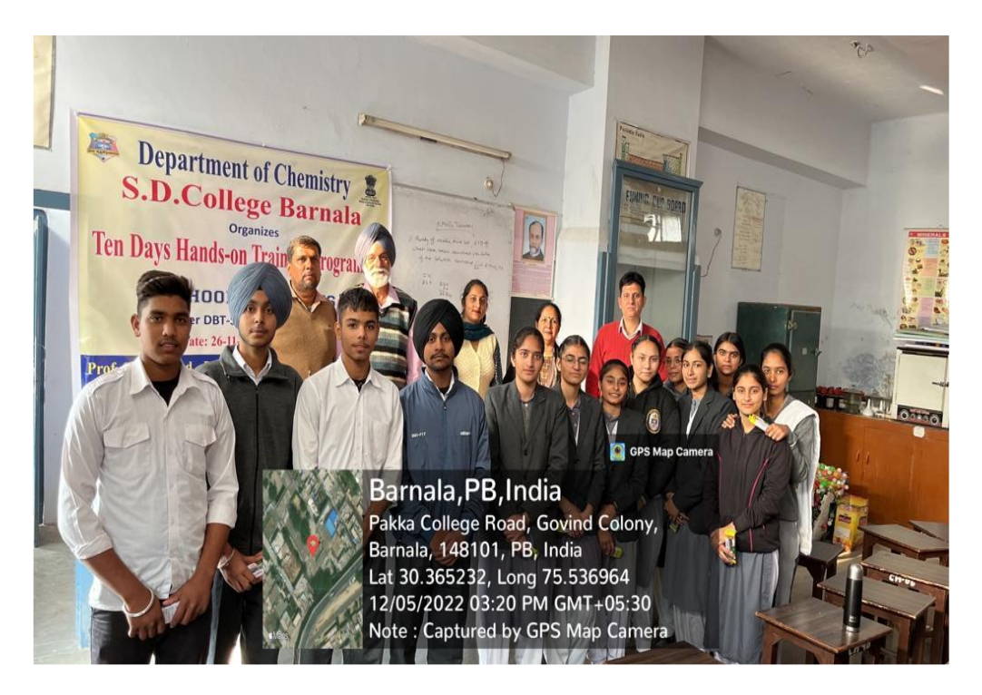
12 Days hands on training for school students in Chemistry (26 November-5 December, 2023)

Department of Chemistry organized 12 days, Hands-on Training Programme for 12<sup>th</sup> standard students of Sarvhitkari Vidyamandir Sen. Sec. School Barnala from 26<sup>th</sup> Nov to 05<sup>th</sup> Dec 2022. In this training programme, students performed practicals related to volumetric analysis, salt analysis & crystallization etc. About 20 students took part in the training