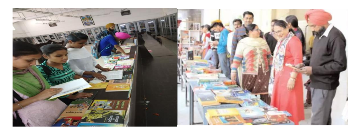
Glimpses of the book exhibition related to Freedom Struggle on 15 August, 2018.

The College Organised a Book Exhibition related to Freedom Struggle on 15 August, 2018. This exhibition included the books on different Freedom fighter in our freedom struggle. It was open exhibition in which citizens and students from different institution participated. More than 400 individuals participated in the event.