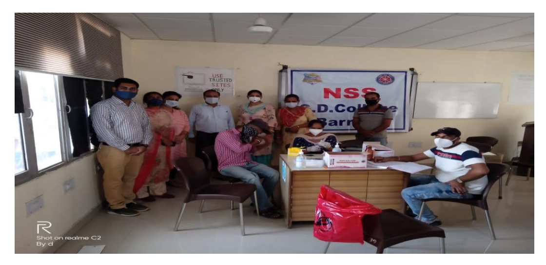
Glimpses of "COVID Vaccination Drive Camp-III" on 7th August, 2021

NSS department organized 3<sup>rd</sup> Corona vaccination camp in collaboration with District Health department on 7<sup>th</sup> August, 2021. The camp was held to vaccinate the students before the commencement of offline classes. Around 200 students and staff members were vaccinated.