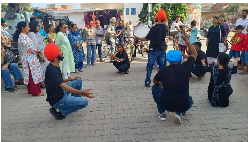
Glimpses of Cycle Rally, Symposium and Nukkad Natak on 28th September, 2022